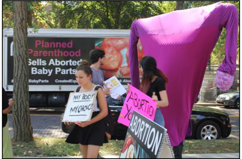
A photo opportunity for abortion advocates with the "gender-neutral uterus" was broken up by the arrival of our Truth Truck emblazoned with pictures of aborted babies.

One NARAL member donned a large purple uterus costume and told The New Political , "I want to bring this gender-neutral uterus to the forefront of this protest," leaving many scratching their heads. But while her message was at best unintelligible, it was at worst an illustration of our position. For while her body was mostly hidden, it was clear there was a person inside the uterus costume—ironically akin to babies hidden from view within their mothers' bodies.