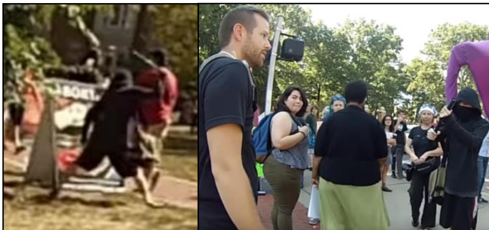
Abortion advocates want pictures of the babies censored so badly they resort to violence. At Ohio University, one student donned a mask and used a club to beat our signs and threaten our team. Watch: http://bit.ly/2cInOWD . The police investigation is ongoing.

But these silly efforts took a violent turn when a masked thug began beating the victims depicted on our signs with a club. He'd emerged from the crowd of abortion advocates with mask and weapon to attack the babies with force reminiscent of the violence with which they'd been initially dismembered. Our team immediately confronted him, halting his tirade. But he held up his weapon in a clear threat of physical violence before disappearing back into the crowd and escaping.