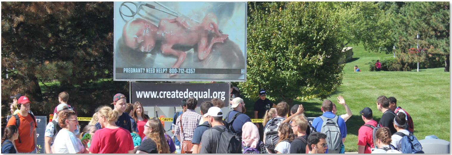
JUMBOTRON DRAWS CROWD | UNIVERSITY OF TOLEDO