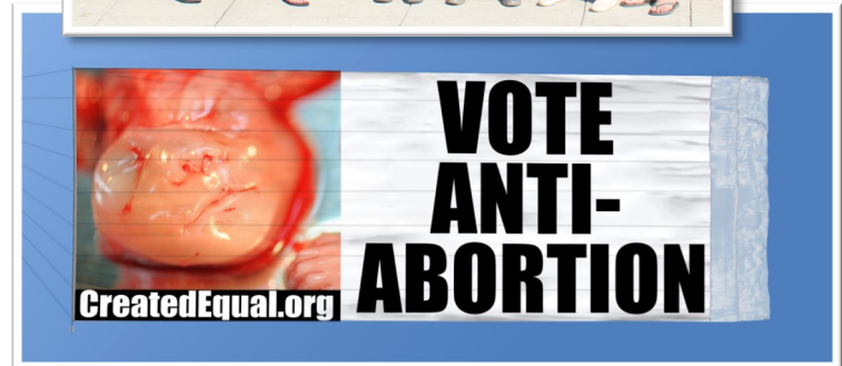
TOP STOP CURTIS BAY ENERGY MIDDLE VOTE ANTI-ABORTION: JUMBOTRON BOTTOM VOTE ANTI-ABORTION: PLANE TRUTH